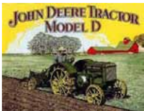
100 years of John Deere Model D

100 years since the first prototype of the Farmall tractor