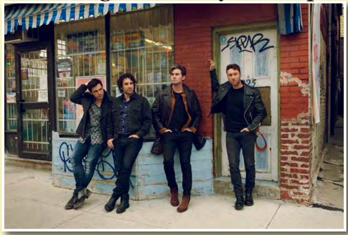
Revered Indie-Rockers playing classic covers live.