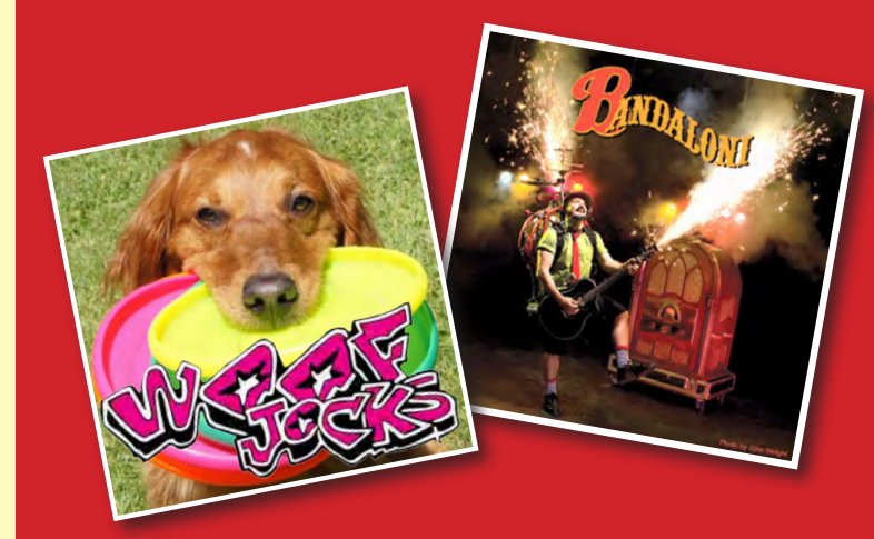
Woof Jocks will be performing feats of agility and skill all weekend long in our Dog Demonstration Area.

School Fair Stage: Saturday 6:15pm & 8:00pm